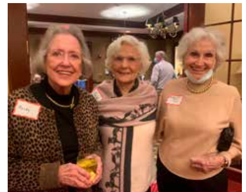
Cedars Fall Harvest Celebration