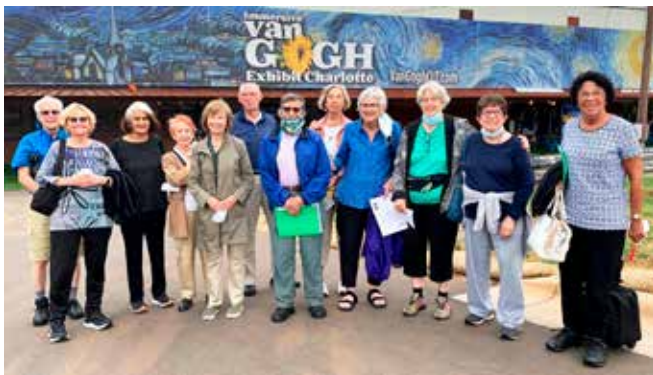
Day trip to Charlotte for the Immersive Van Gogh exhibit